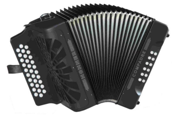
Figure 2: Button accordion

Each design probably has its own special advantages but is not always equally suitable for every type of music (or even every key). Furthermore, a variety of different playing techniques and notations have developed for these instruments.