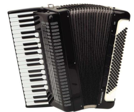
Figure 1: large, multi-choir piano accordion

The differentiation between the knob handle and the piano keyboard is the most obvious outwardly, but (at least for the button accordions) says nothing about the type of tone assignment.